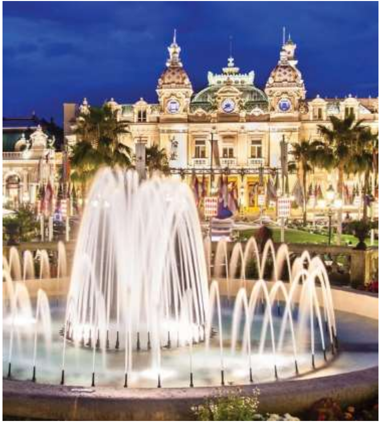
9 Days • 11 Meals: 7 Breakfasts, 1 Lunch, 3 Dinners

HIGHLIGHTS... Nice, Monaco, Monte Carlo, Choice on Tour, Cannes, Lérins, Grasse, Fragonard Perfumerie Workshop, Saint-Jean-Cap-Ferrat, Villa Ephrussi de Rothschild, Nice Flower Market, St. Paul de Vence