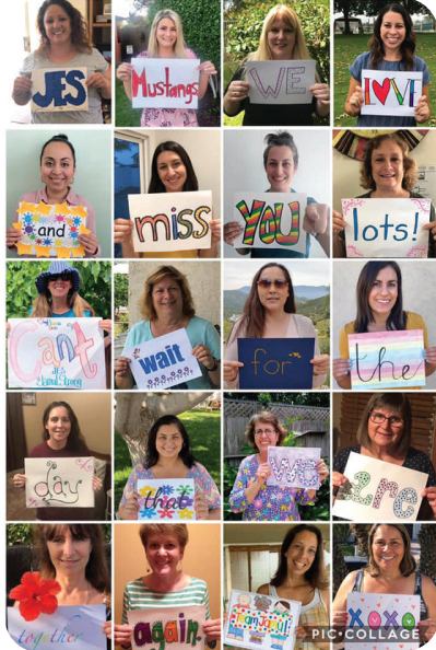
Distance Learning – Jamul-Dulzura Union School District teachers sent a message to their students via Zoom.