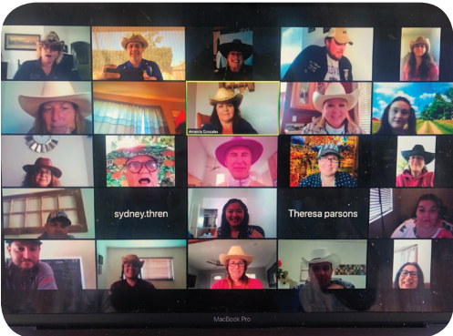
Keeping spirits up while getting the work done. Mountain Empire Union School District held a western-themed Zoom meeting.