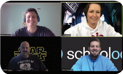
Grossmont Union High School staff attended sessions led by GUHSD Digital Learning Coaches from Digital Lesson Design to Zoom to GSuite and more to prep for virtual teaching.