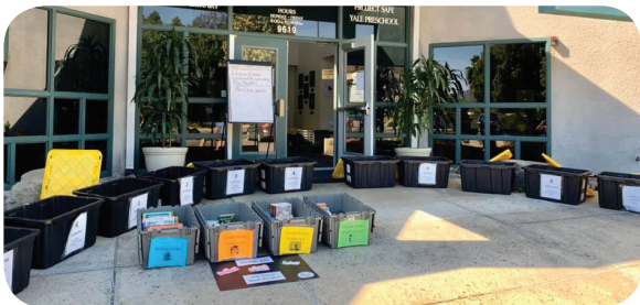
Santee School District distributed free K-8 level reading books to students along with students' weekly assignment packets.