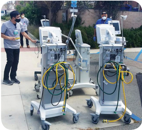
Grossmont College loaned a total of 18 ventilators to two local hospitals and the State of California in an effort to increase the supply of the life-saving equipment for COVID-19 patients.

With schools transitioning to distance learning as a result of COVID-19, local educators went above and beyond to support each other while schools were closed. Check out how students, teachers, and staff stayed together while staying apart during the shutdown.