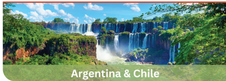
Argentina & Chile