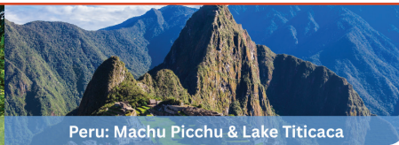
Peru: Machu Picchu & Lake Titicaca